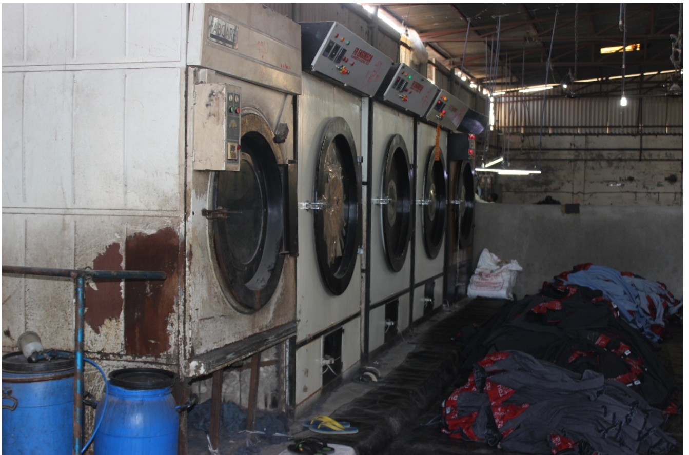
High tech machinaries and maximum strength to compete with challenges