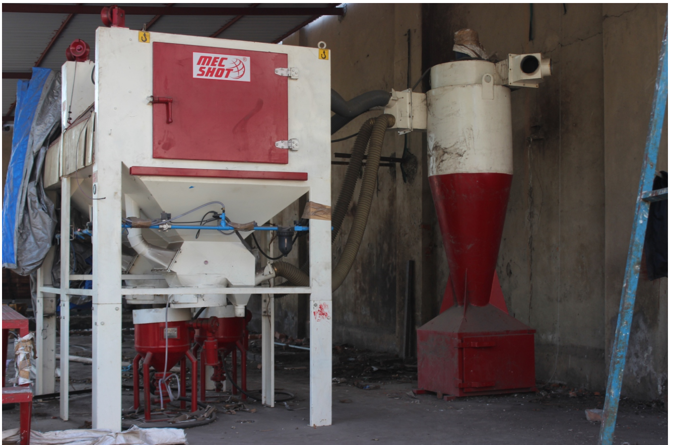
Large work space ,equipped with finest elemental process and capacity