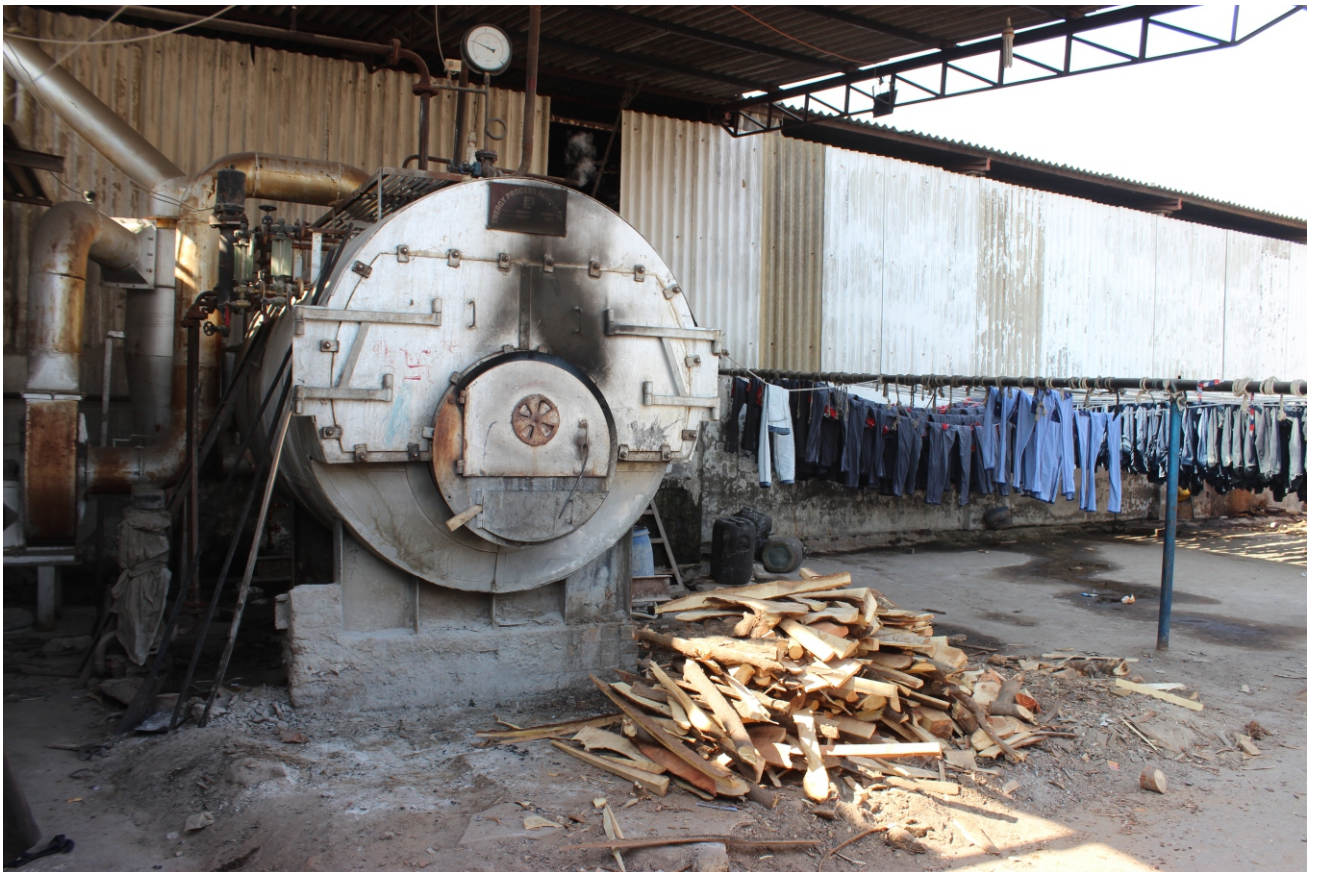
Large work space ,equipped with finest elemental process and capacity